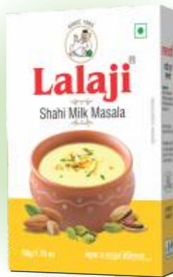
SHAHI MILK MASALA