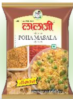
POHA MASALA ( JEERAVAN)