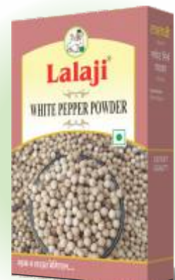
WHITE PEPPER POWDER