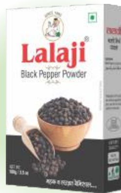
BLACK PEPPER POWDER