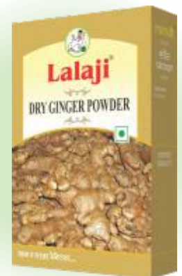
DRY GINGER POWDER