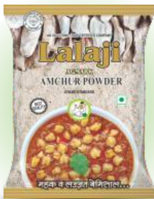
DRY MANGO POWDER